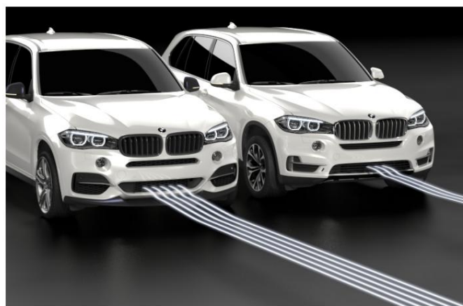
M Performance Power Kit with new performance-optimized engine data