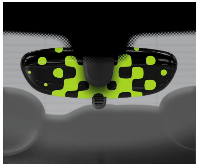
Interior mirror cap VIVID GREEN